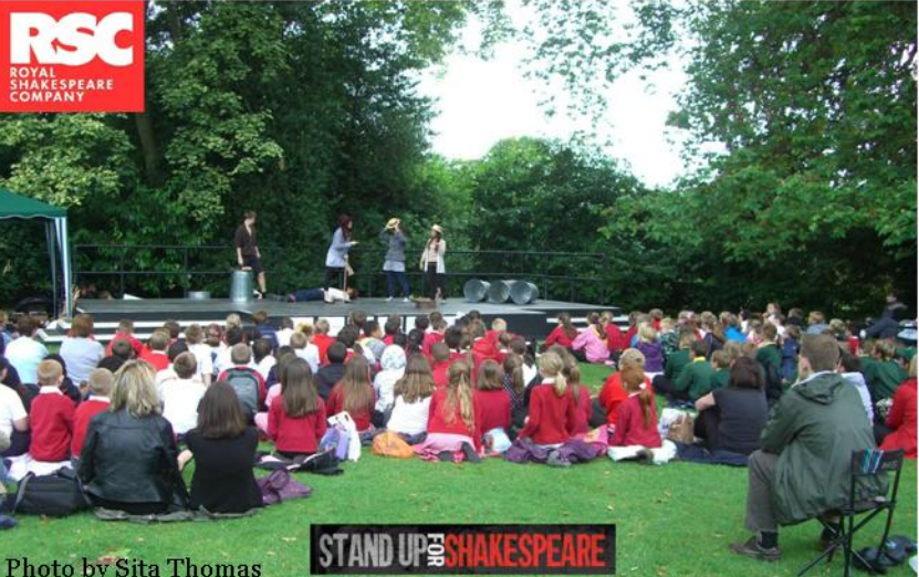
Example of work experience at the RSC

“The reflective process involved made me more spontaneous when answering questions about what I felt I could bring to the job.”