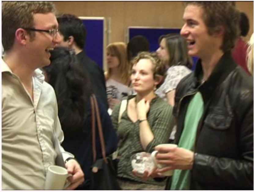
Advantage Award Ceremony 2009