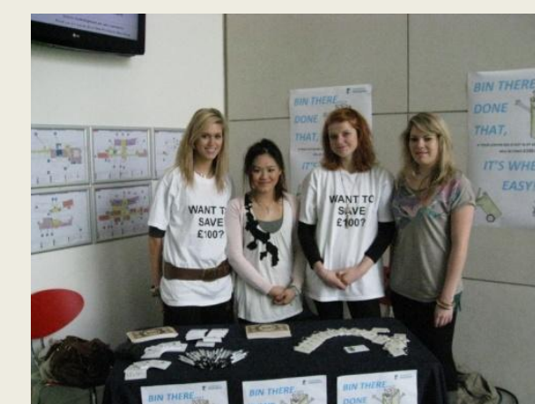
PR Project Management

I cannot stress how much of an invaluable course the Nottingham Advantage Award is whilst studying. It has proved highly useful to me whilst studying at Nottingham and is a programme I believe many people will benefit from.