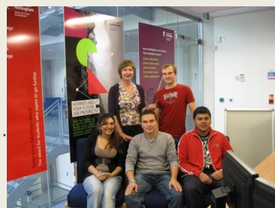
Inside Employment: Investigation into Finance

Support the Centre for Career Development Strategy.