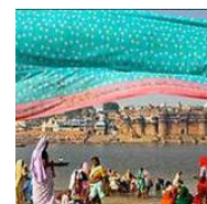
Travel & Cultural Experiences