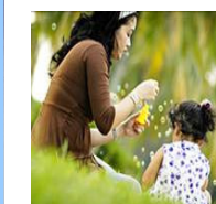
Being a carer